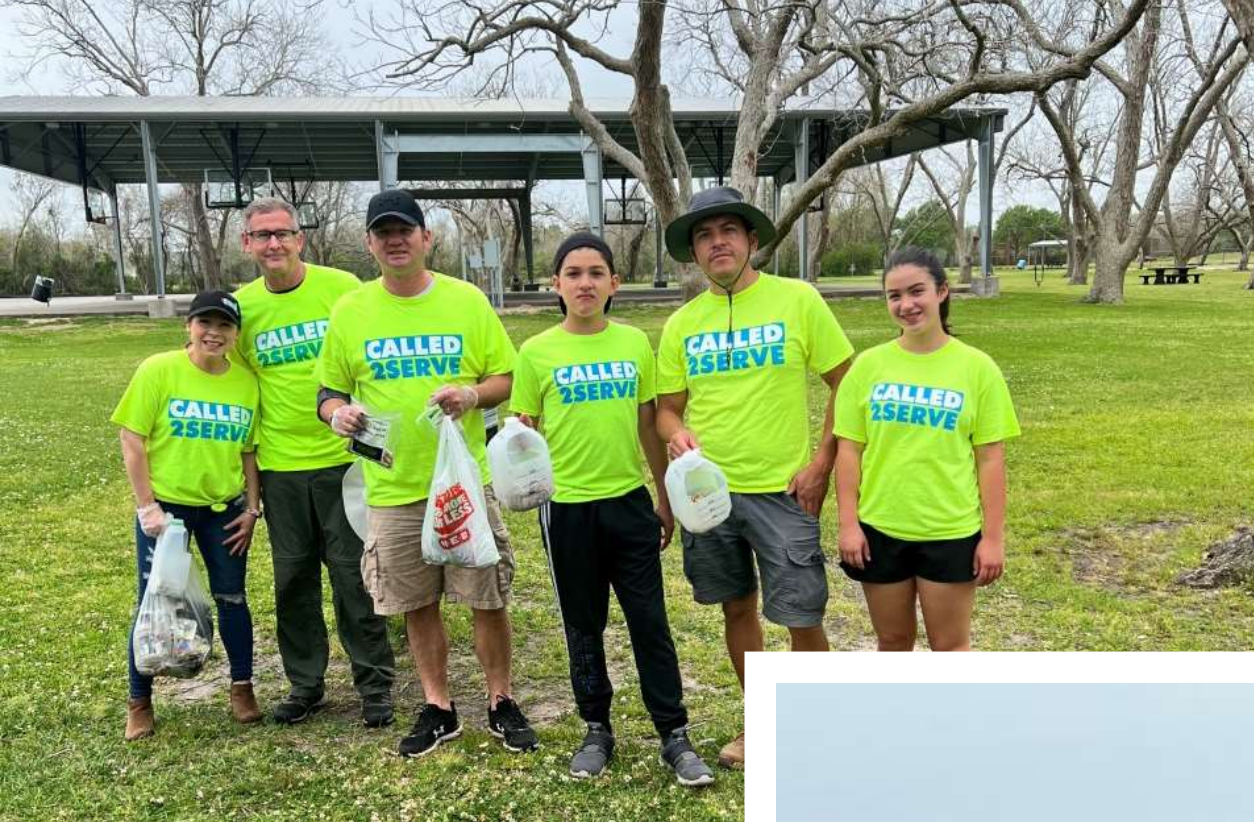
Pictures from cigarette butt pick up at Bates and Dickey Parks on April 2, 2022.