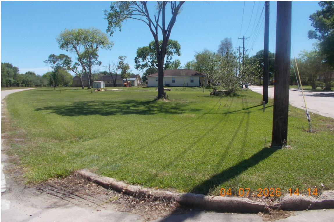
View looking towards the property from the corner of TJ Wright & Hancock