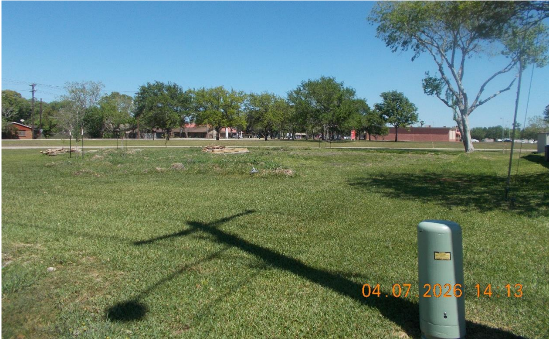
View looking northeast from the property CR44