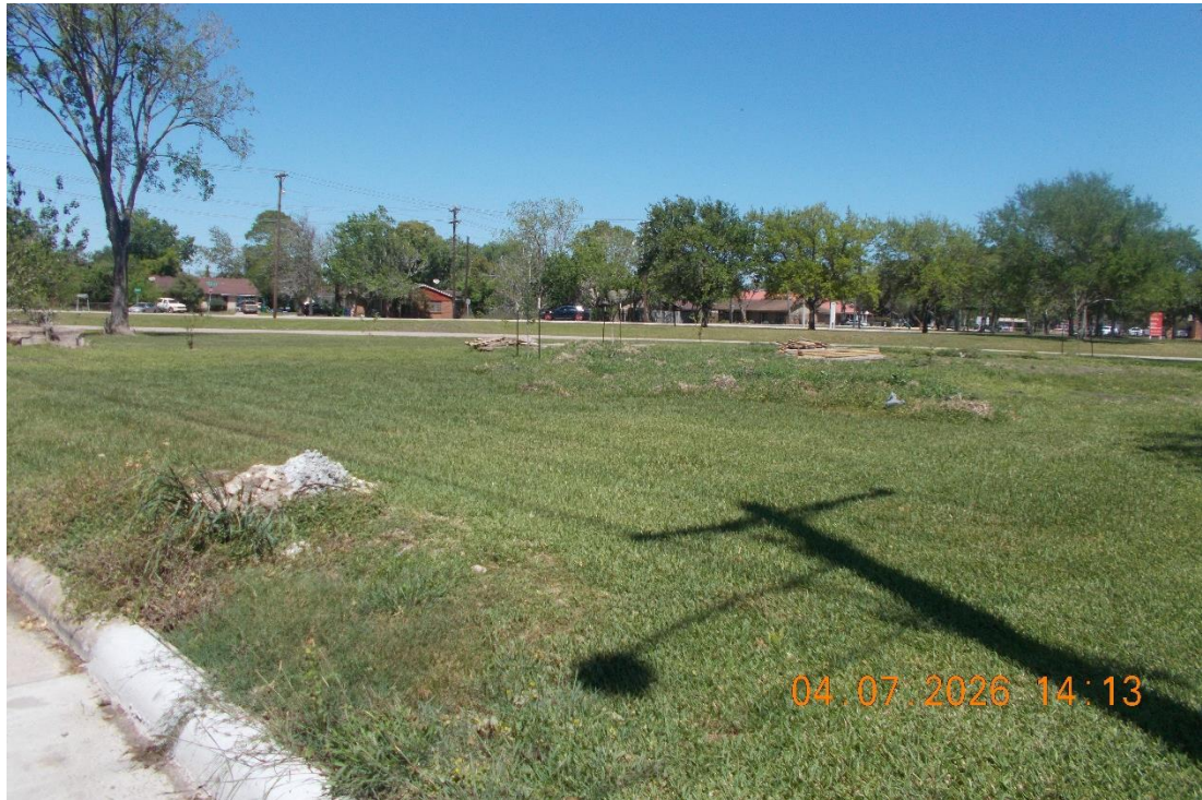
View looking north from TJ Wright/frontage towards CR44