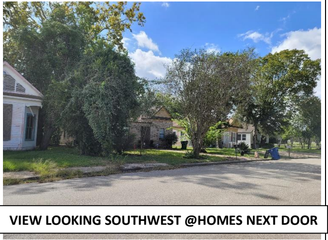
VIEW LOOKING SOUTHWEST @HOMES NEXT DOOR