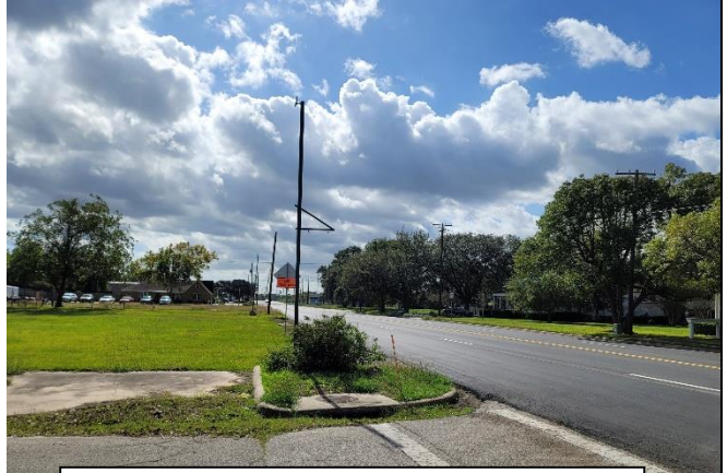
VIEW LOOKING SOUTH AT PROJECT SITE