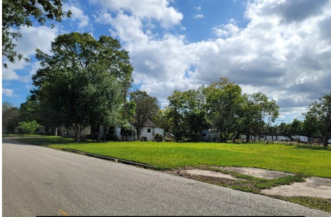
VIEW LOOKING SOUTH AT PROJECT SITE