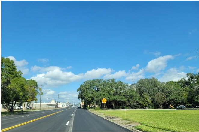
VIEW LOOKING NORTH ON S. VELASCO, SITE ON RT.