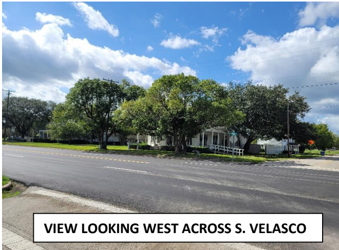
VIEW LOOKING WEST ACROSS S. VELASCO