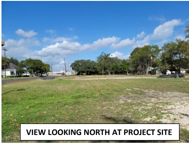
VIEW LOOKING NORTH AT PROJECT SITE