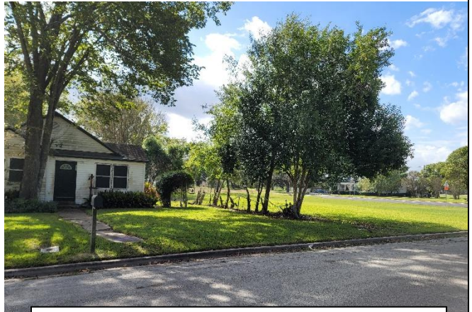
VIEW LOOKING SOUTH AT ADJACENT HOME