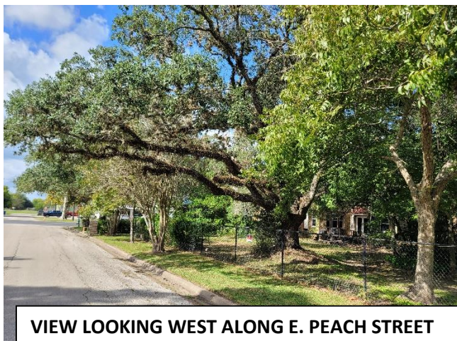
VIEW LOOKING WEST ALONG E. PEACH STREET