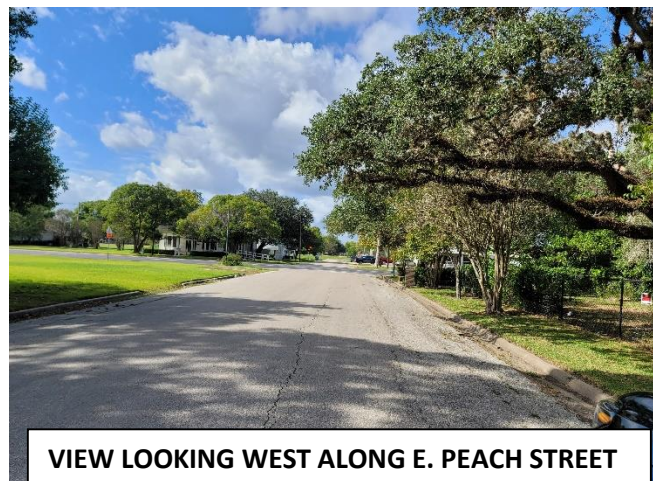
VIEW LOOKING WEST ALONG E. PEACH STREET