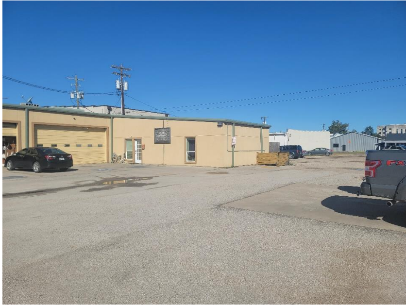
View of 115 E. Mulberry St., Looking North showing location of Salon in rear