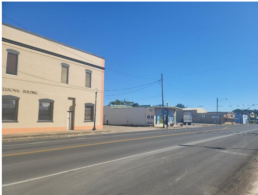
View of 115 E. Mulberry St., Looking East, showing location frontage