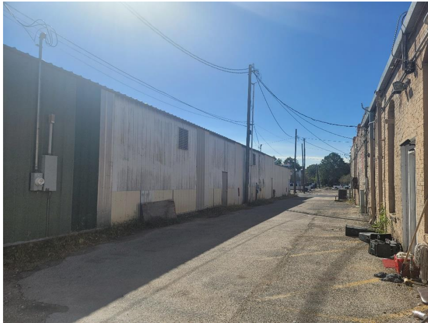
View of rear alley of 115 E. Mulberry St., Looking South towards Mulberry St.