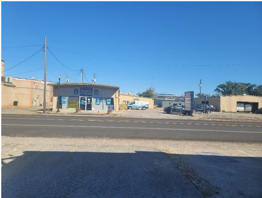
View of 115 E. Mulberry St., Looking North showing location of Salon in rear

EXECUTIVE SUMMARY: Jennifer Bell, Beau Bazaar Salon is requesting consideration of a Specific Use Permit for a Microblading Studio for property located at 115 E. Mulberry Street, Angleton, TX., within the Central Business District (CBD).