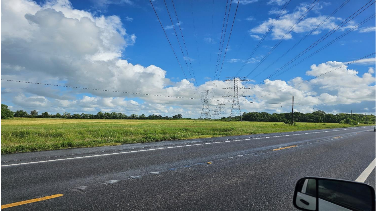
View looking northwest toward Site from SH 35