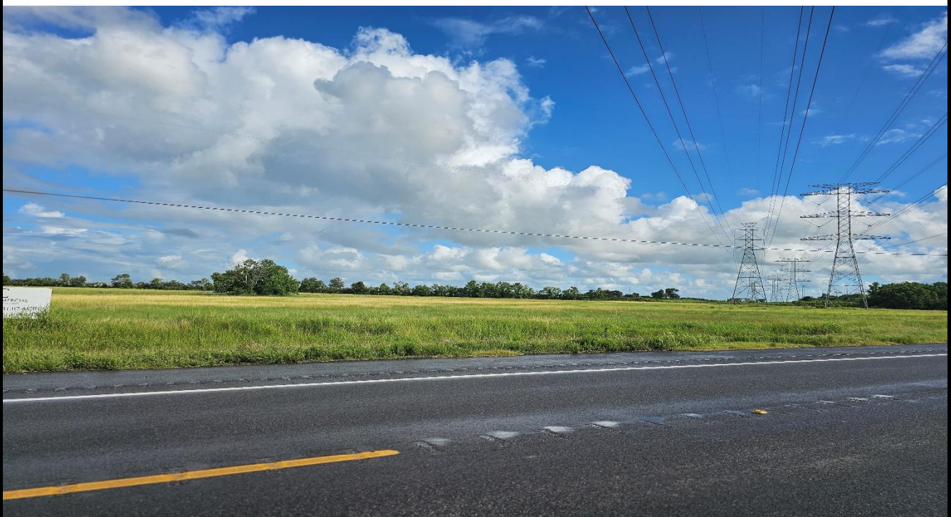
View of Property Site from looking Northwest from SH 35