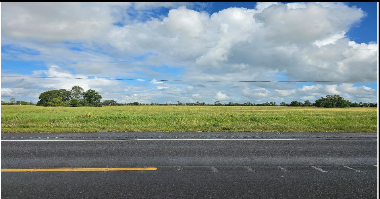
View of Property Site from looking west from SH 35