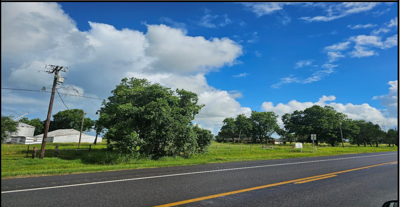
View of Residential Homes to the South from SH 35