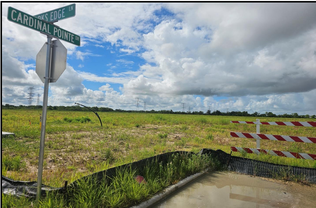
View from Windrose Green Subdivision looking east

The Planning and Zoning Commission should adopt this Final Report and forward it to City Council with a positive recommendation of this Specific Use Permit (S.U.P.) application for Electrical Power Distribution Substations in the Commercial-General Zoning District, (C-G), for approval consideration and appropriate action with the following conditions: