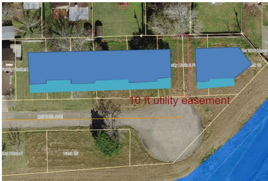
Possible Layouts for future townhomes (Northside)