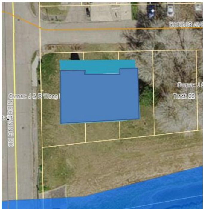
Possible Layouts for future townhomes (Southside)