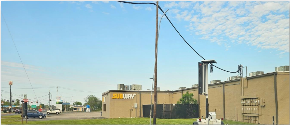
View of rear yard showing the fenced playground area.