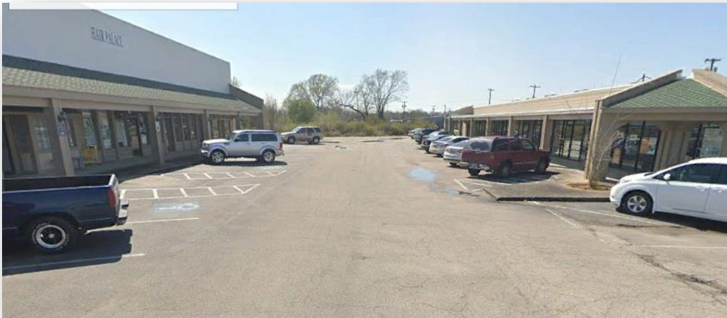
View of the Subject property Suites D & E on the right