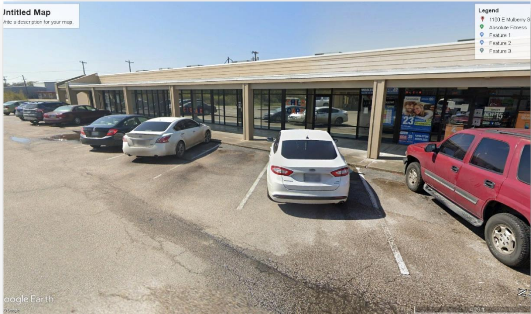
View looking 1100 E. Mulberry St., Suites D&E at Subject property