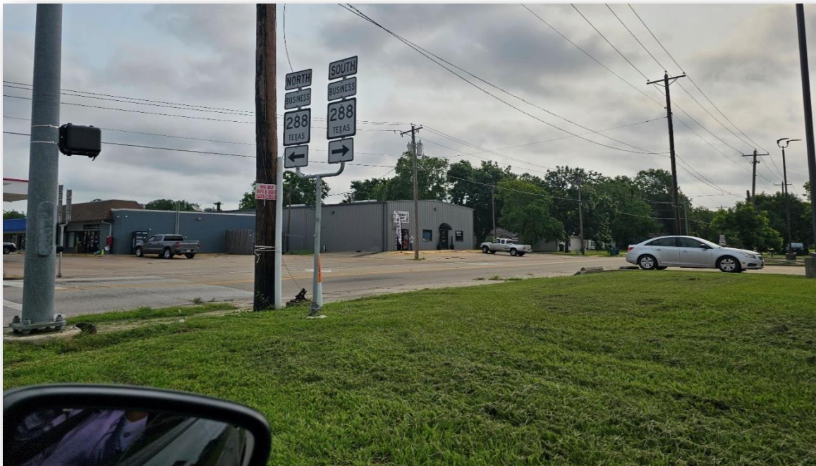
View of the Subject property looking Northeast from SH288 Business at E. Wilkins St.