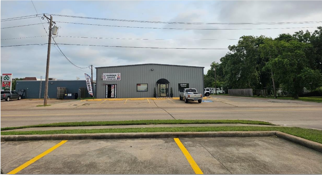
View looking North at the Subject Site from E. Wilkins St.