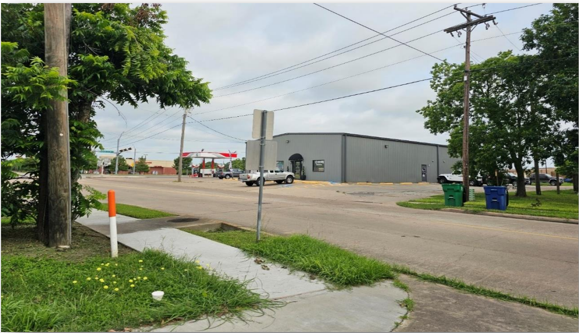
View looking Northwest at the 4 Subject from E. Wilkins St.