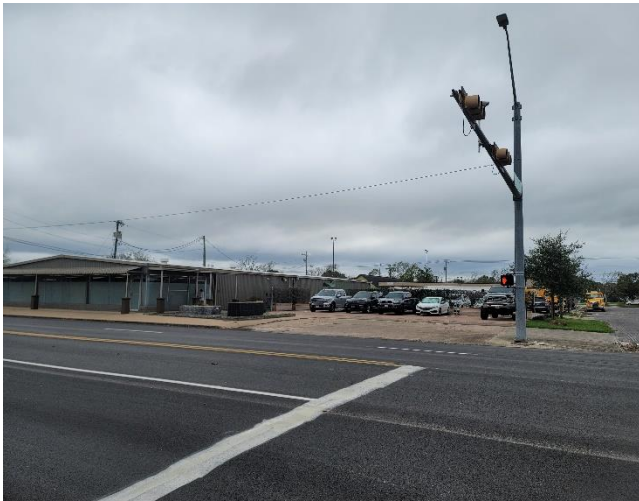
VIEW LOOKING WEST AT PROJECT SITE