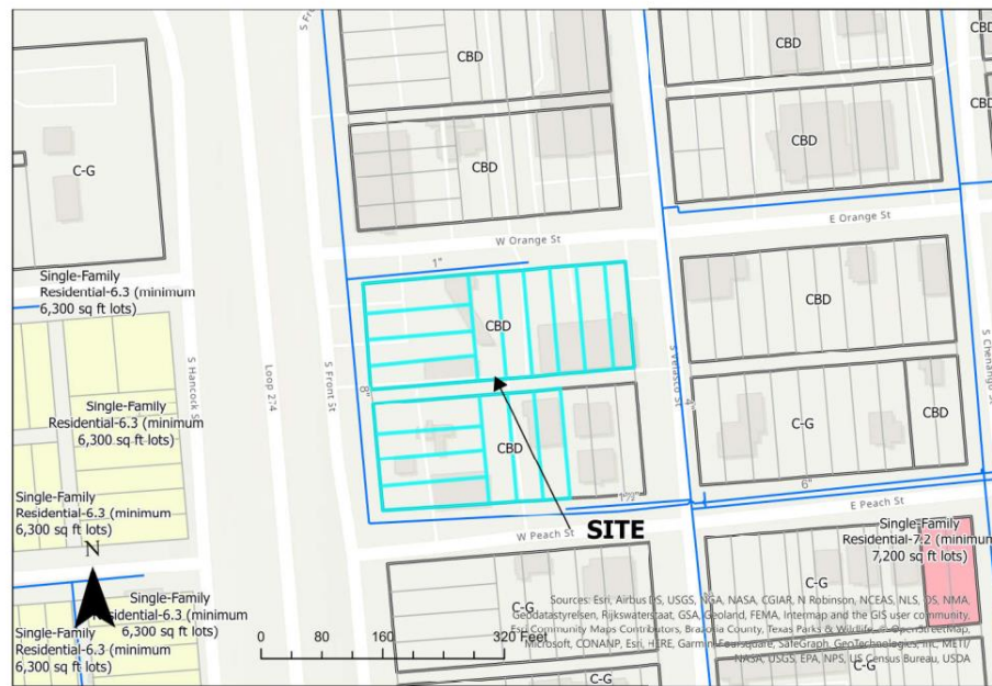
Property location Map