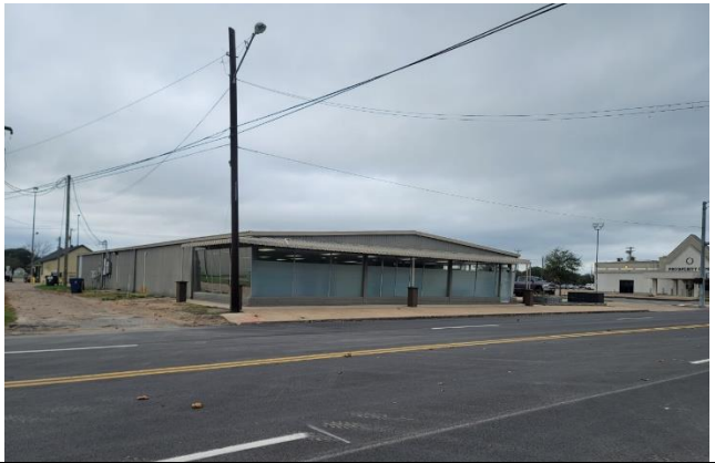
VIEW LOOKING WEST @ SITE