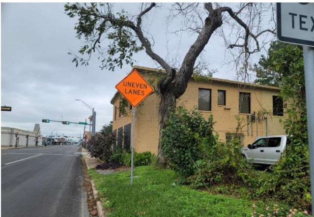
VIEW LOOKING NORTH ON S. VELASCO