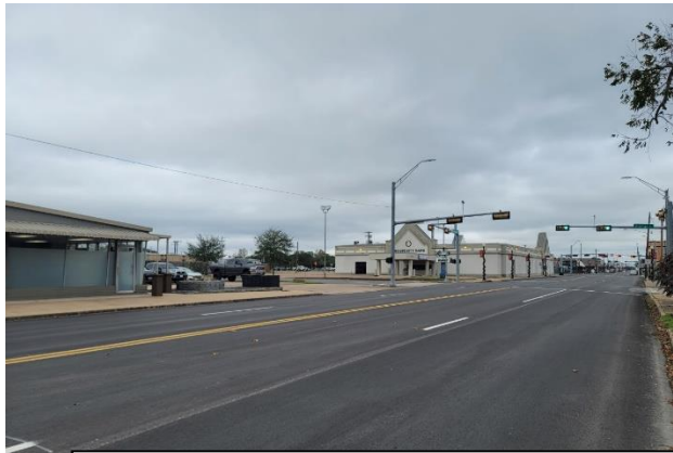
VIEW LOOKING S. VELASCO SITE ON LEFT