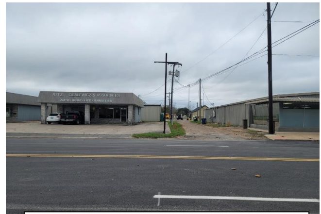
VIEW LOOKING WEST TOWARD SITE