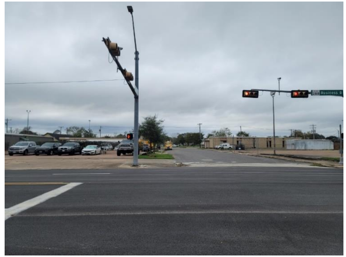
VIEW LOOKING WEST AT PROJECT SITE