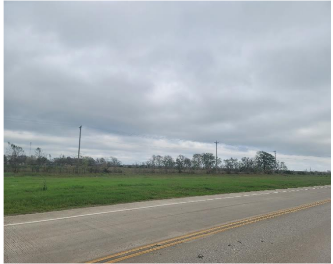
VIEW LOOKING NORTH AT SITE FROM