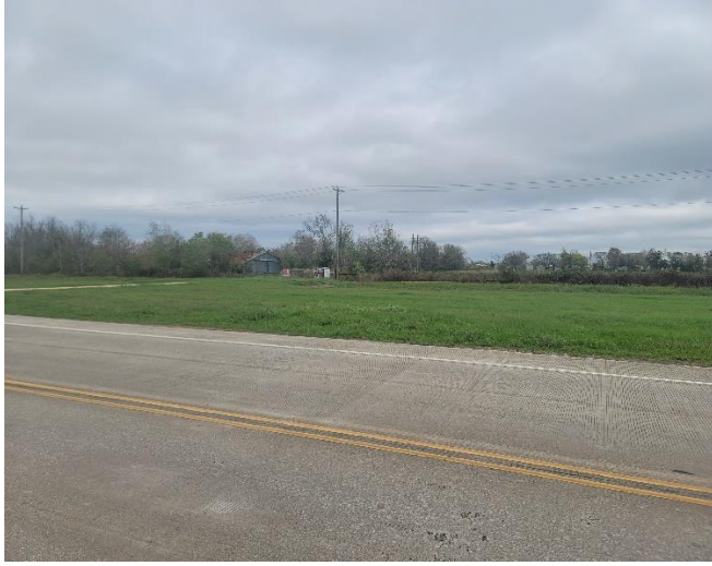
VIEW LOOKING NORTH AT SITE FROM CR220