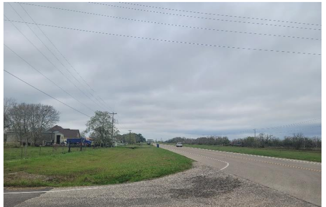
VIEW LOOKING WEST ON CR220, SITE ON RIGHT