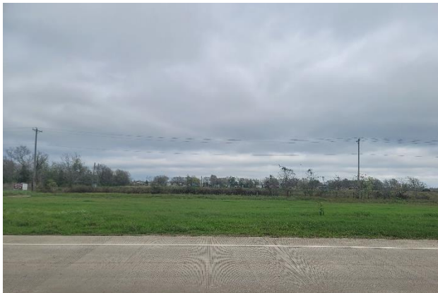
VIEW LOOKING NORTH AT SITE FROM CR220