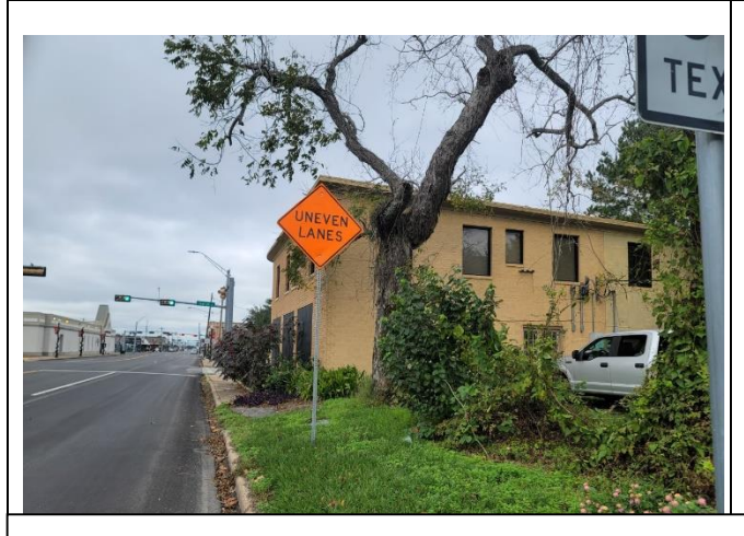
VIEW LOOKING NORTH ON S. VELASCO