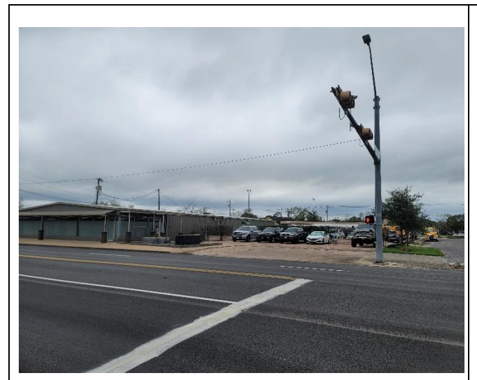
VIEW LOOKING WEST AT PROJECT SITE