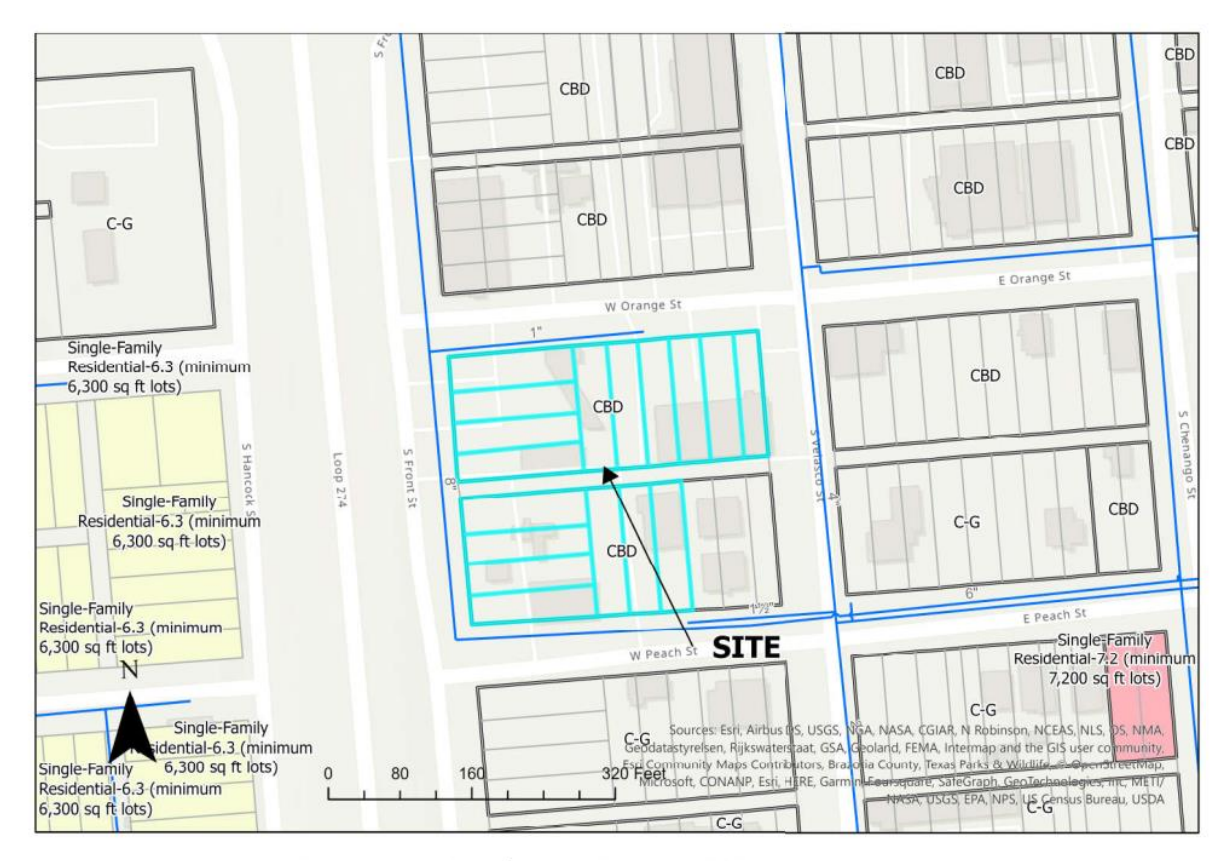
Property location Map