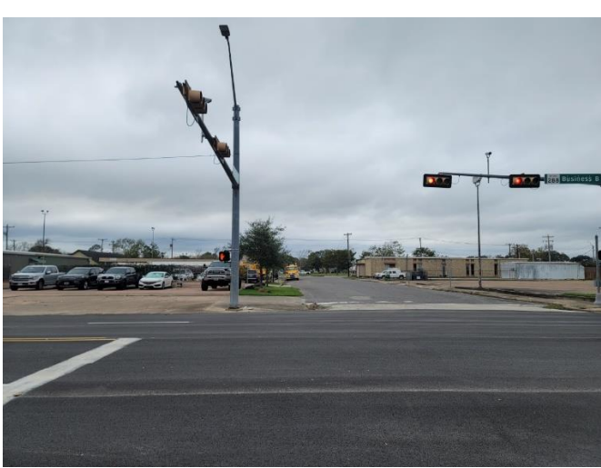
VIEW LOOKING WEST AT PROJECT SITE