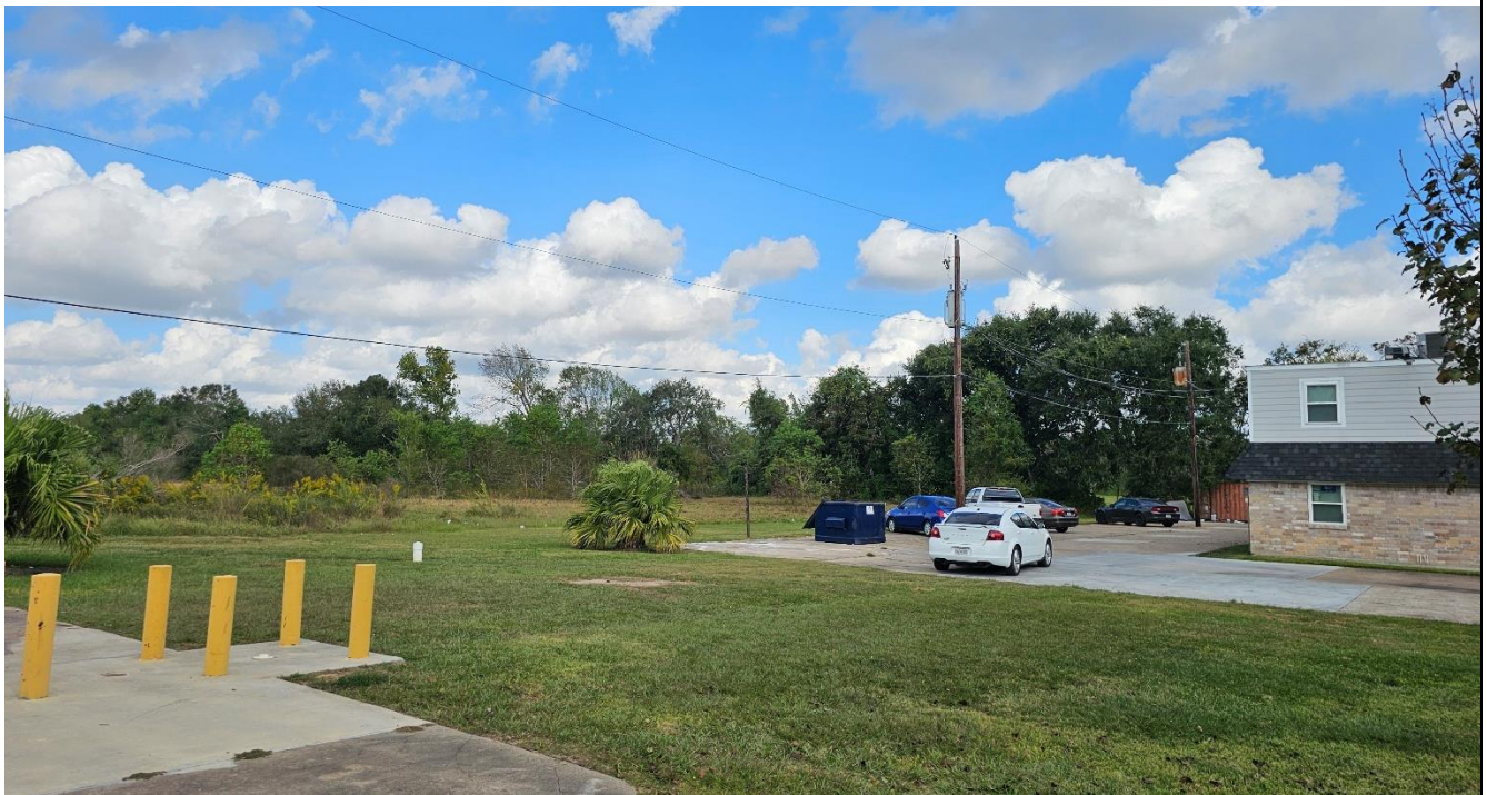
View looking north at subject tract north of the apartment units