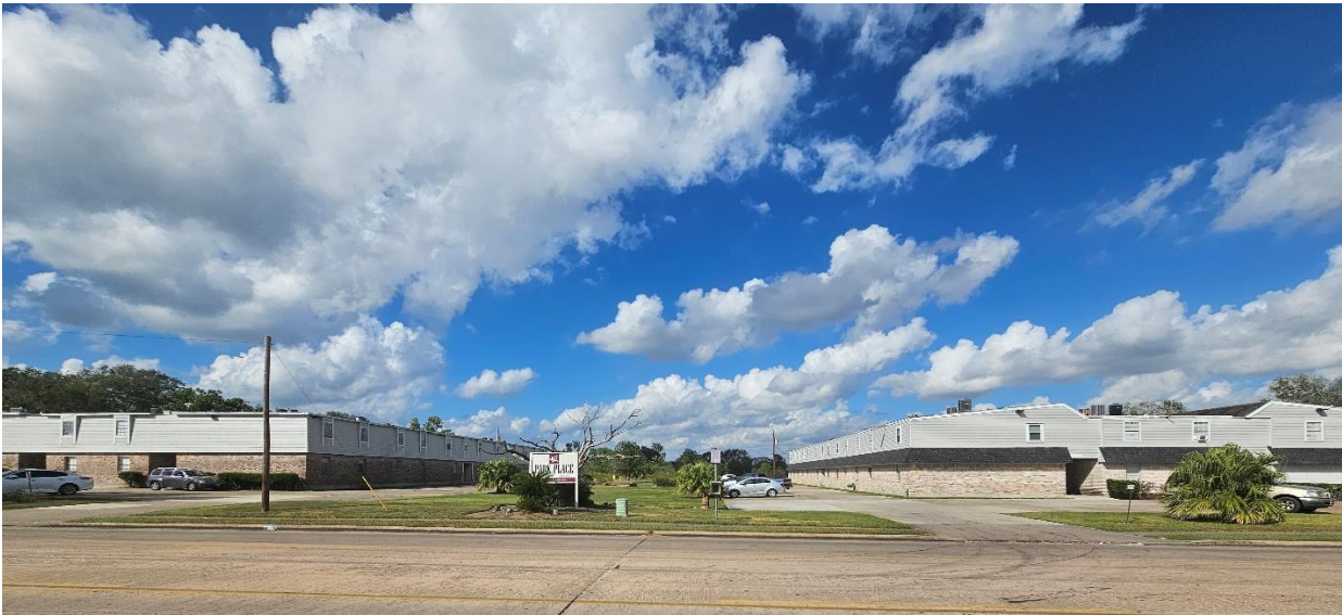
View looking north from Cemetery Rd. from property frontage