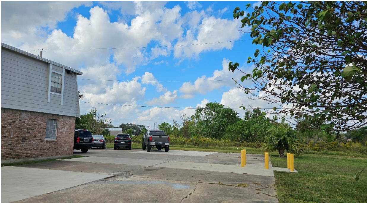
View looking north at subject tract north of the apartment units