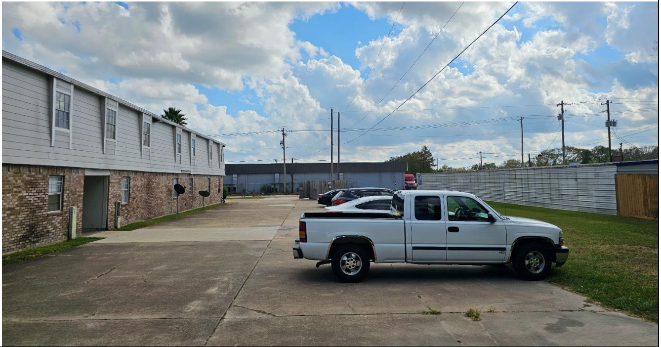
View looking south toward Cemetery Rd.