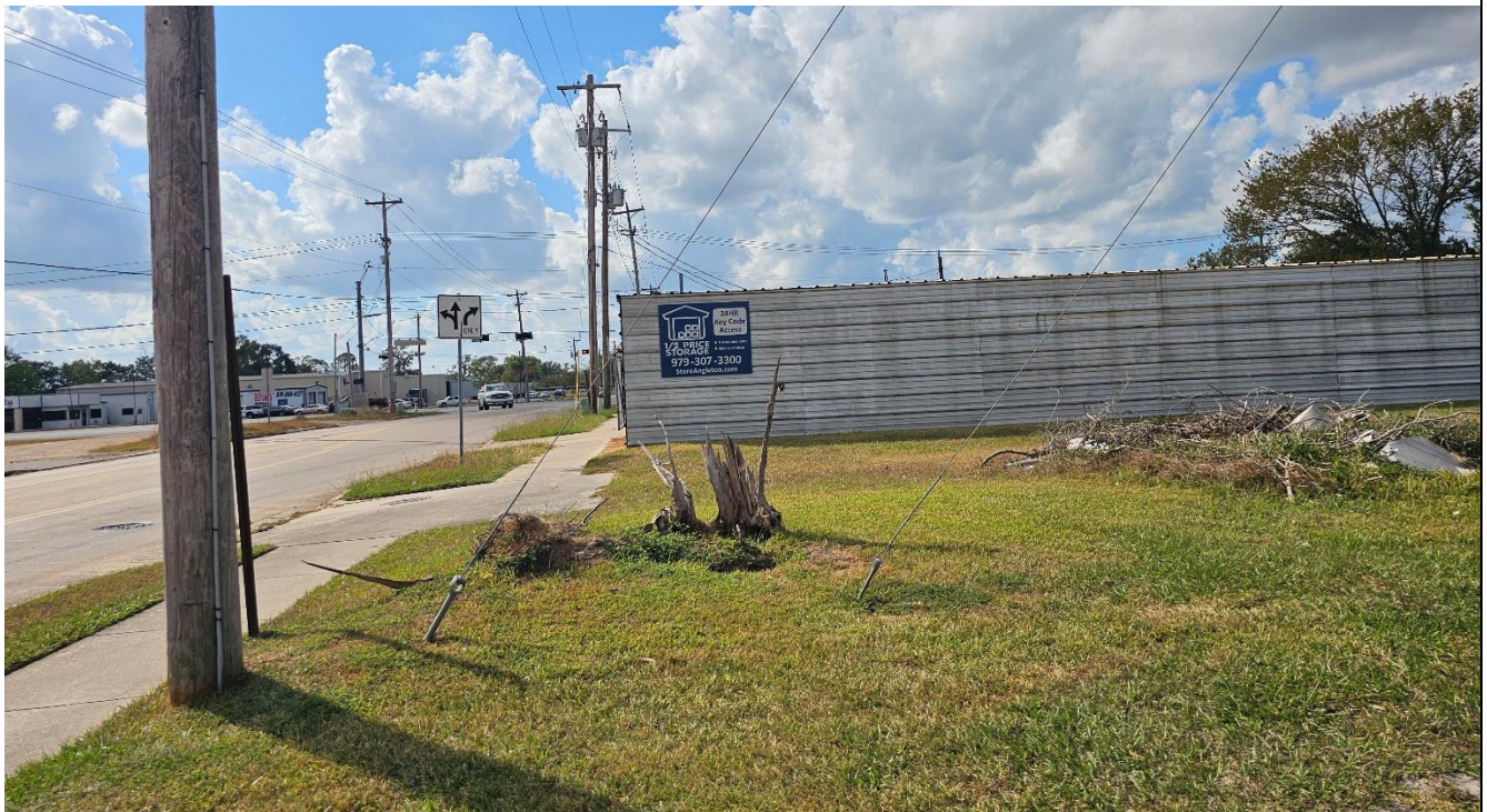
View looking West on Cemetery Rd. toward SH288 B, Mini-Storage Units to the right