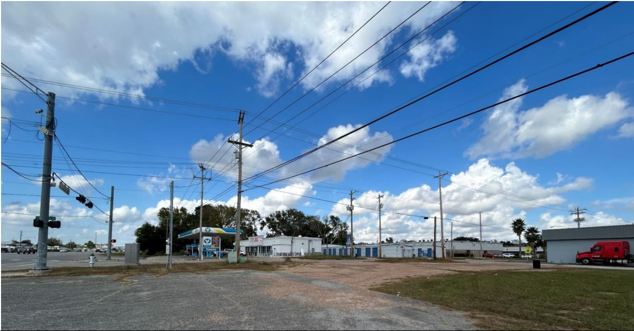
View looking north along SH288B toward intersection of Cemetery Road, Site is to the right