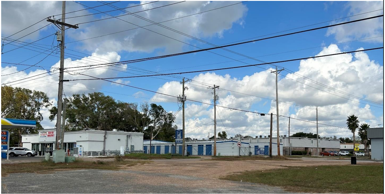
View looking north-easterly along SH288B toward the intersection of Cemetery Road, Site is to the right