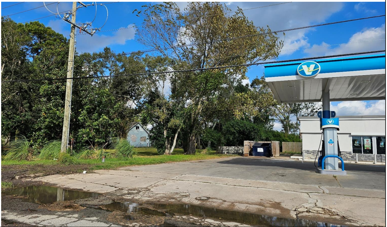
View looking north-easterly from SH288B