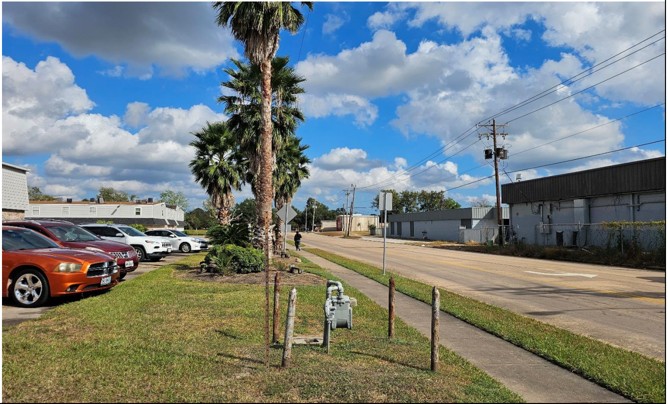
View looking east along Cemetery Rd. toward property frontage