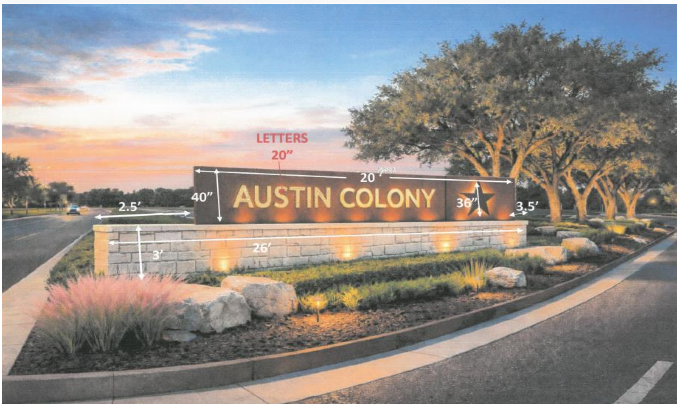
View of proposed monument sign