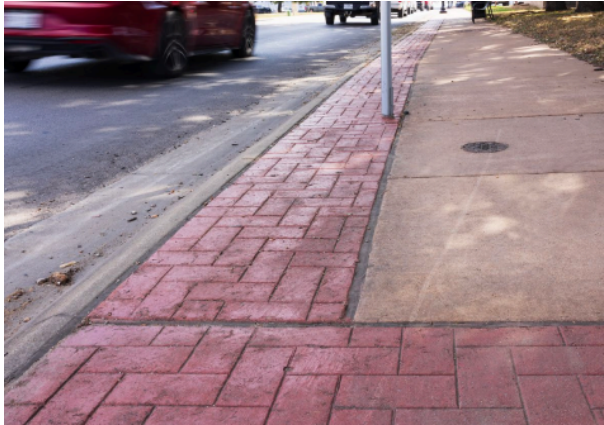
Integrally Colored Concrete