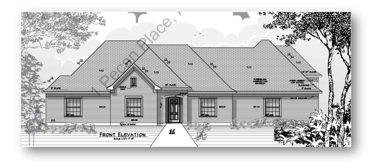
Elevation of Proposed Single Family Home