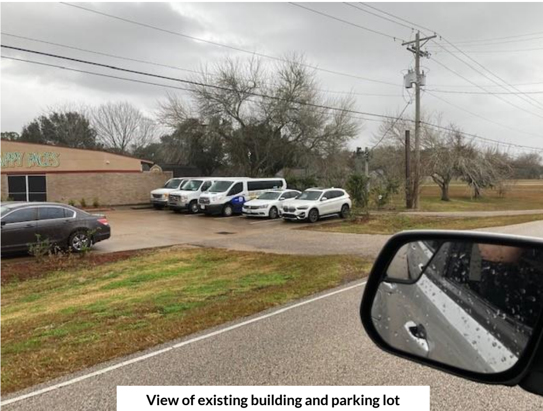
View of existing building and parking lot