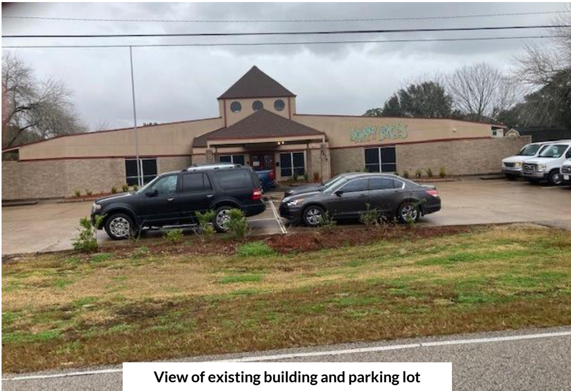
View of existing building and parking lot