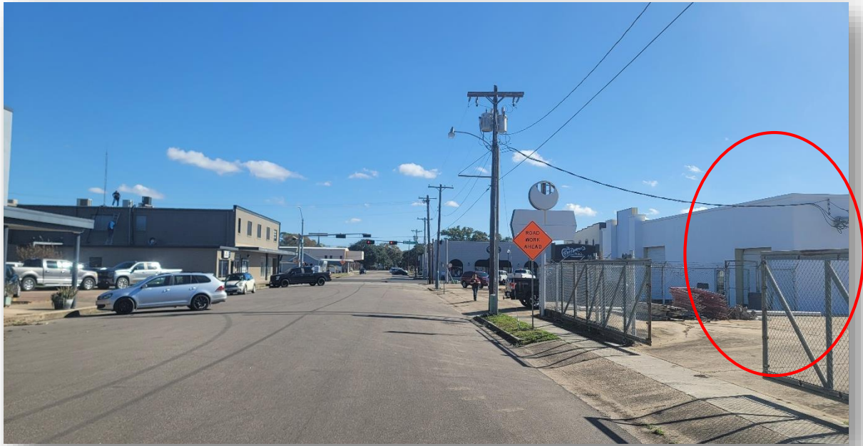
View of 117 West Myrtle Street on right