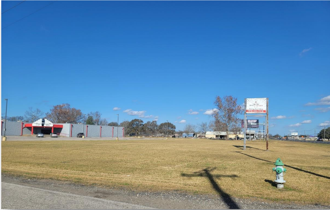
View from Cemetery Road looking north at the Subject property