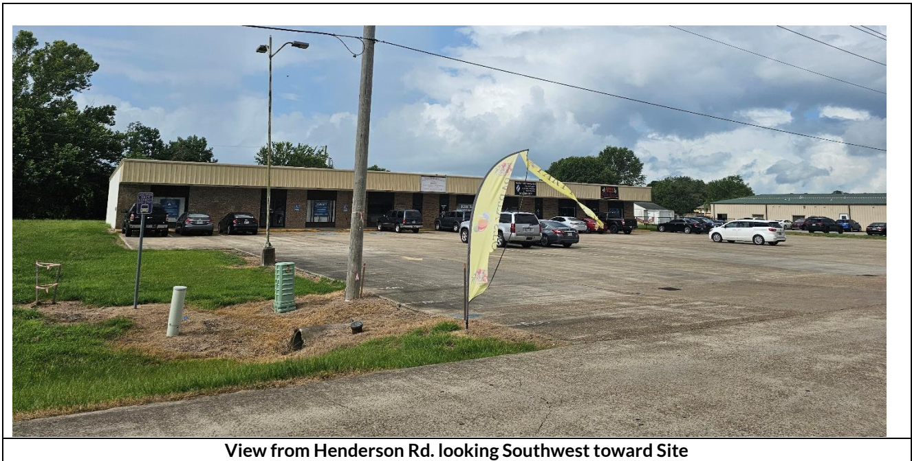
View from Henderson Rd. looking Southwest toward Site