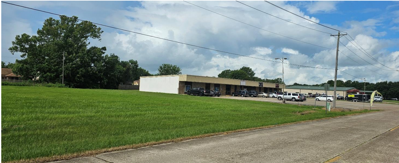
View from Henderson Rd. looking Southwest toward Site