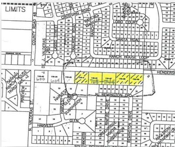
Rezoning Exhibit Map from the 2005 Case