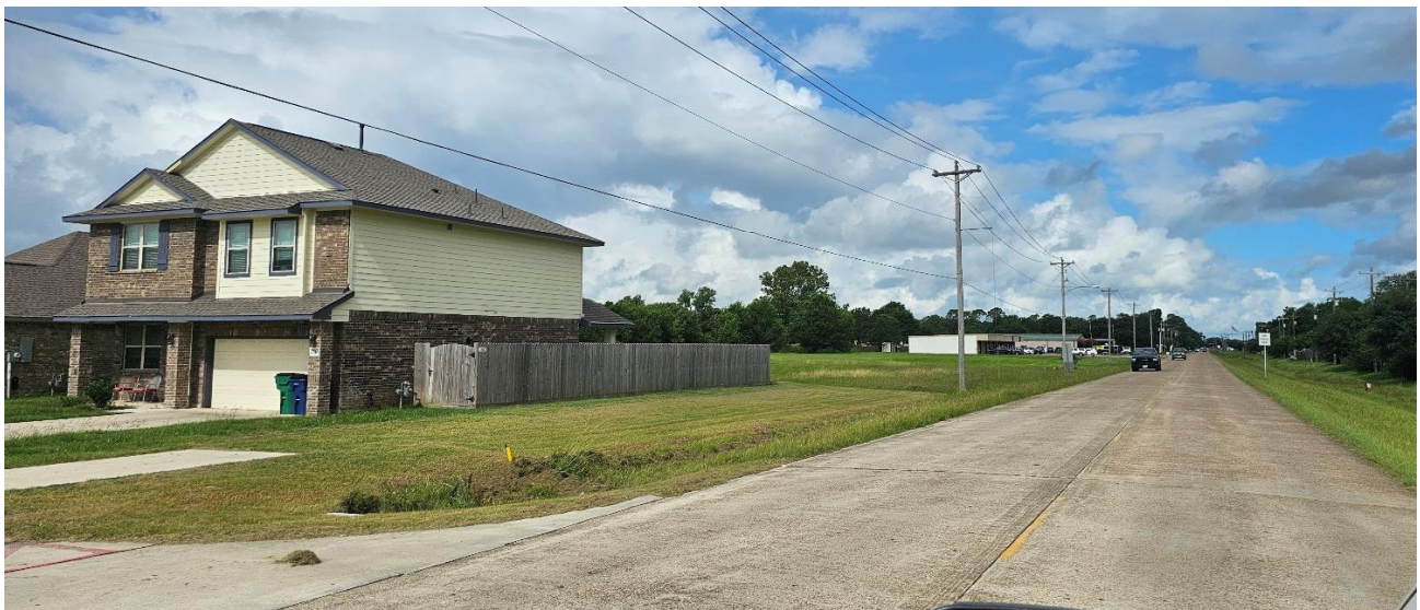
View looking from Henderson Rd. looking Southwest toward Site