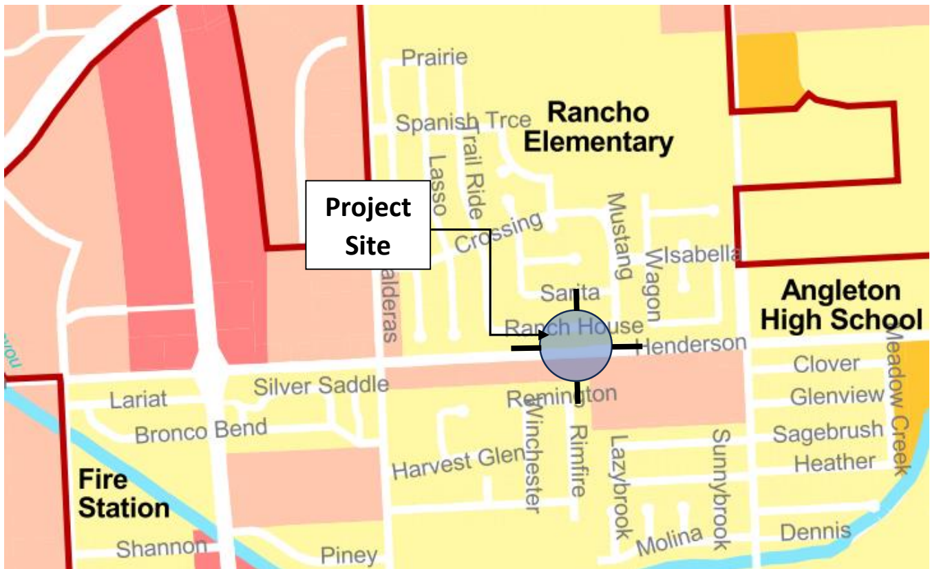
Future Land Use Map

The adopted Future Land Use/Comprehensive Plan designates the subject property requested to be rezoned as Office/Retail.