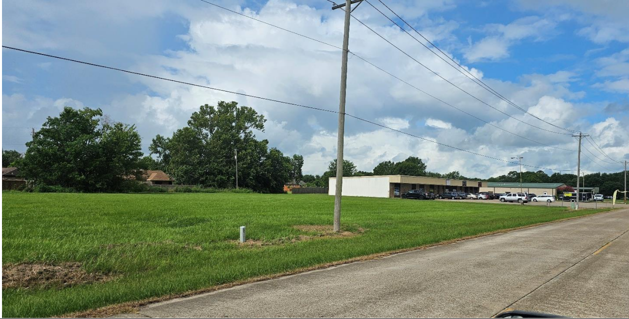
View from Henderson Rd. looking Southwest toward Site