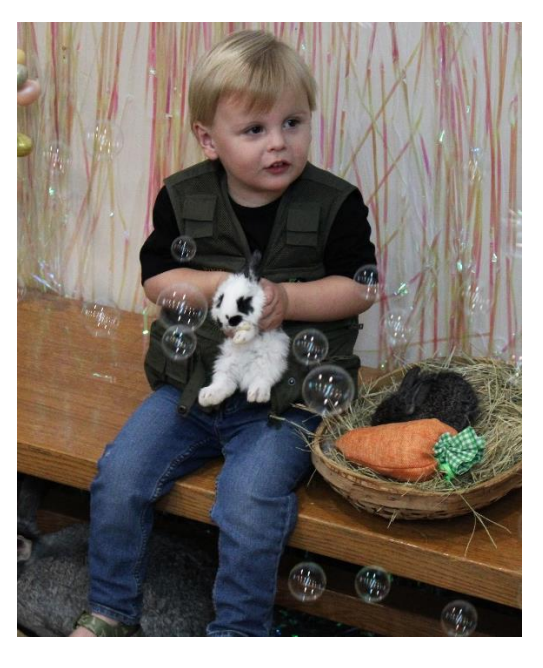
Hop on in to the library!

Children enjoyed photo opportunities with real live Easter bunnies during Hippity-Hoppity Tales.